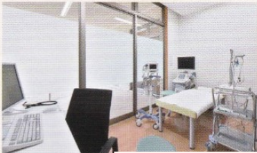
Tan-tan Medical Clinic

Tan-tan has a coordination of a welfare facility for the elderly, a place for community exchange, a medical clinic and a cafeteria.