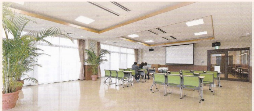
Community exchange room